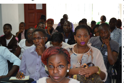
Attentive NUBSA members taking stock of their options

Speakers drawn from the field of Forensic, Bioinformatics, Manufacturing and Engineering, took students through career opportunities in Bioinformatics, building Curriculum